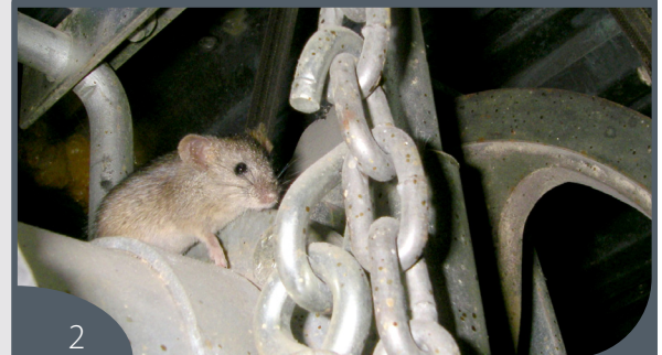
2 Live rodent sighting.