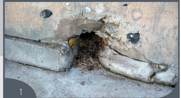
1 Burrows in house foundation.